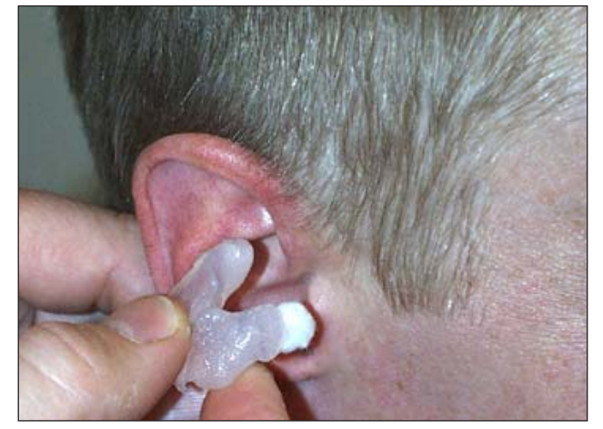
9. Wait until the material is hard and carefully remove the mould from the ear.