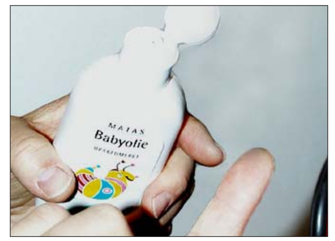
7. Apply some baby oil to your fingers, to prevent the material from sticking to your fingers.