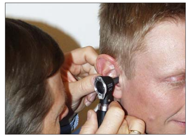
2. Inspect the ear canal carefully. If the eardrum not can be seen, or if there is excess earwax or foreign object in the ear canal, do not attempt to make an earmould, but refer the client to an ENT doctor.