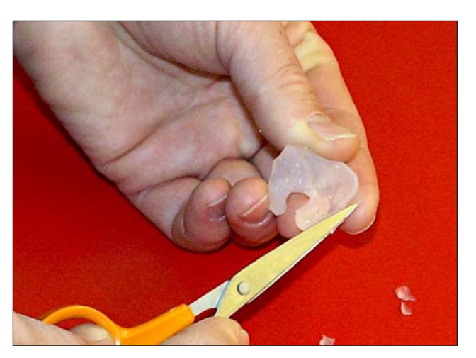
11. Use a sharp scissors to remove excess material.