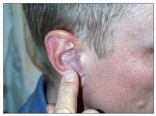
8. Form the material as a shell mould in the concha and remove excess material.