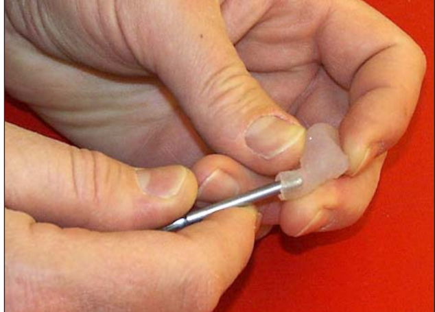
12. Force the tip of the earmould into a straight angel and drill the sound canal, using the special drill.