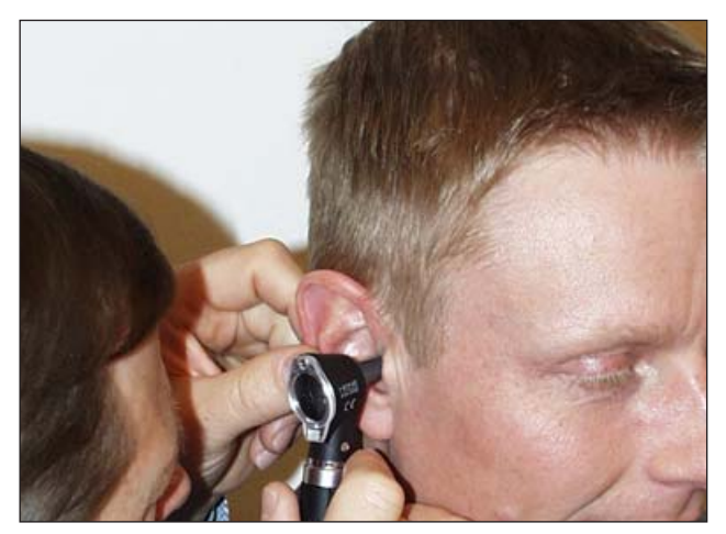
10. Inspect the ear for cotton/material.